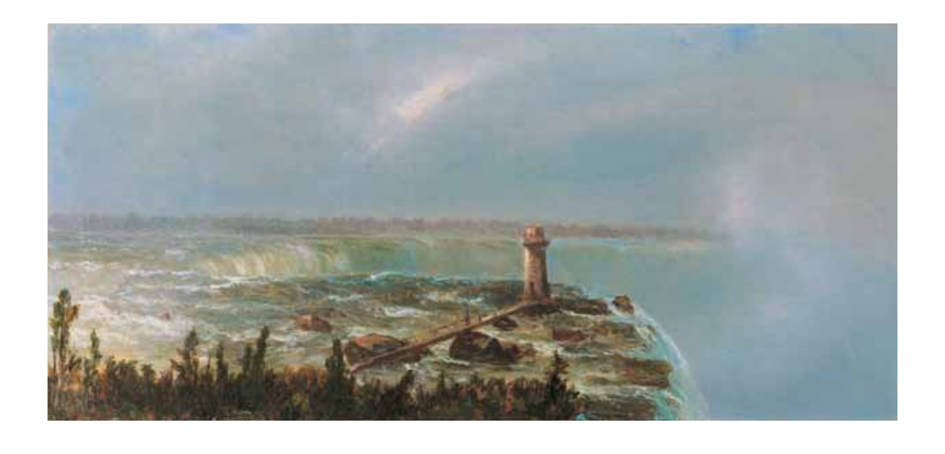
Régis François Gignoux (1814–1882) Niagara Falls Oil on canvas 9 <sup>7</sup>/8 x 20 <sup>7</sup>/8 inches Signed lower left: R Gignoux