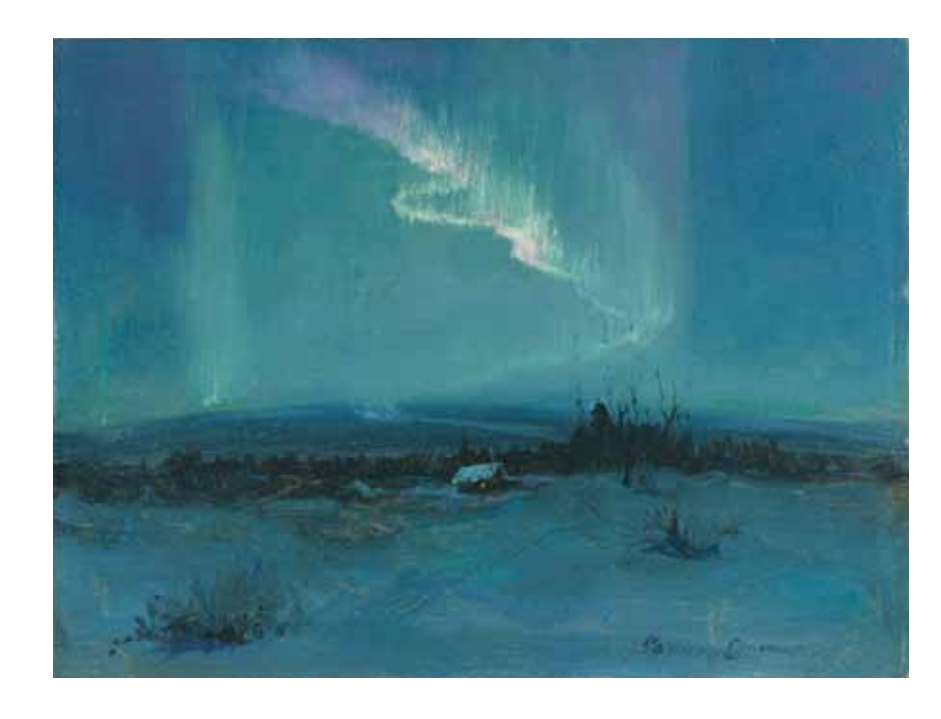
Sydney Laurence (1865–1940) Northern Lights Oil on canvas board 12^{1/16} x 16^{1/16} inches Signed lower right: Sydney Laurence