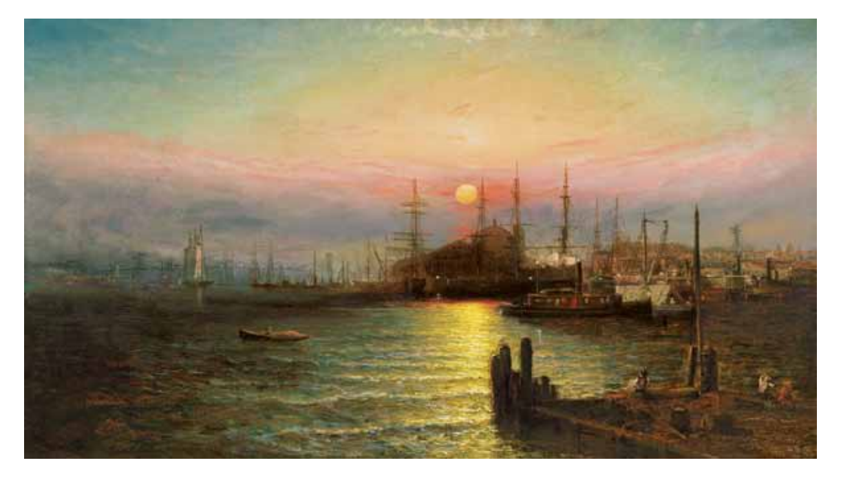
Elisha Taylor Baker (1827–1890) East River Scene, Brooklyn, NY, ca. 1886 Oil on canvas 18 <sup>1</sup>/<sub>8</sub> x 32 <sup>1</sup>/<sub>8</sub> inches Signed and dated lower right: E Taylor B 188 [illeg.]