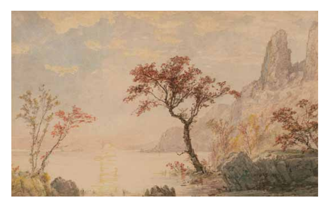
Jasper Francis Cropsey (1823–1900) Under the Palisades, 1899 Watercolor on paper 12^{7/8} \times 20^{7/8} inches Signed and dated lower right: J.F. Cropsey 18 99.