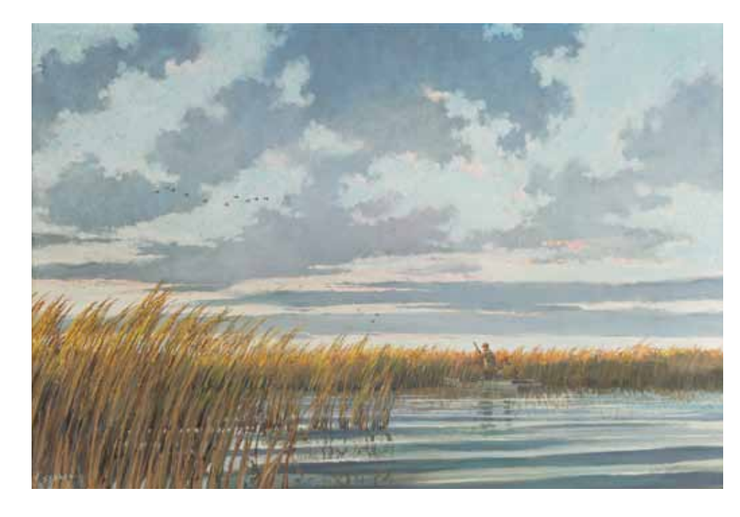
Eric Sloane (1905–1985) Duck Hunting Oil on masonite 24 <sup>3</sup>/<sub>8</sub> x 36 inches Signed lower left: SLOANE