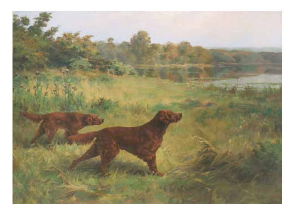
Percival Leonard Rosseau (1859–1937) A~Grey~Day, 1913 Oil on canvas 25~^{13}/_{16}~x~35~^{1}/_{2} inches Signed, dated, and inscribed lower right: Rosseau~/~1913~/~Copyright~Reg.