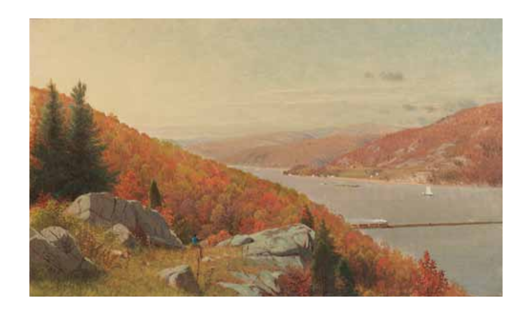
Frank Anderson (1844–1891) Hudson River View in Autumn, 1867 Oil on canvas 11<sup>1</sup>/<sub>4</sub> x 18<sup>3</sup>/<sub>4</sub> inches Signed and dated lower left: FANDERSON / 1867