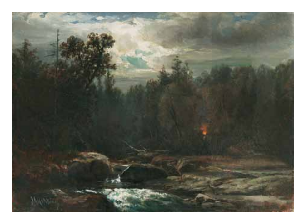
Joseph Antonio Hekking (1830–1903) Campfire at Twilight Oil on canvas 10 <sup>1</sup>/<sub>8</sub> x 14 <sup>3</sup>/<sub>16</sub> inches Signed lower left: JAHekking