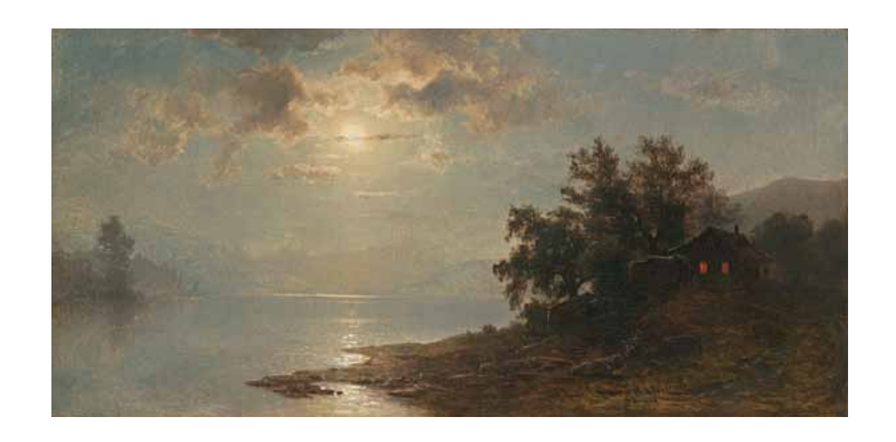
Hermann Fuechsel (1833–1915) Moonlit Lake, 1864 Oil on canvas 10^{1/4} \times 20^{3/16} \, \text{inches} Signed, inscribed, and dated lower right: Hermann Fuechsel / NY. 1864.