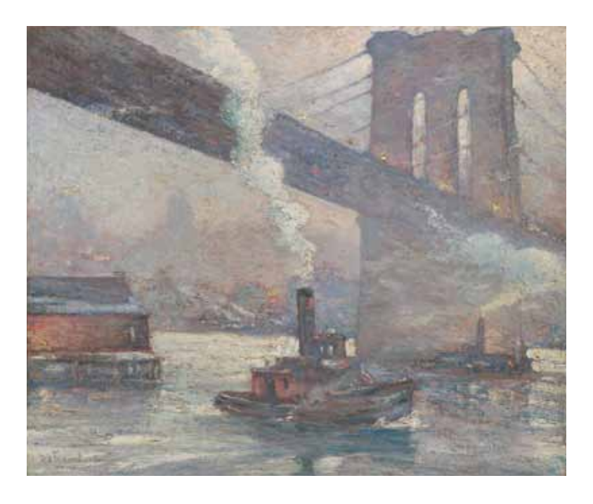
Bella De Tirefort (1894–1993) Brooklyn Bridge Oil on canvas 20<sup>3</sup>/<sub>16</sub> x 24<sup>1</sup>/<sub>8</sub> inches Signed lower left: de Tirefort