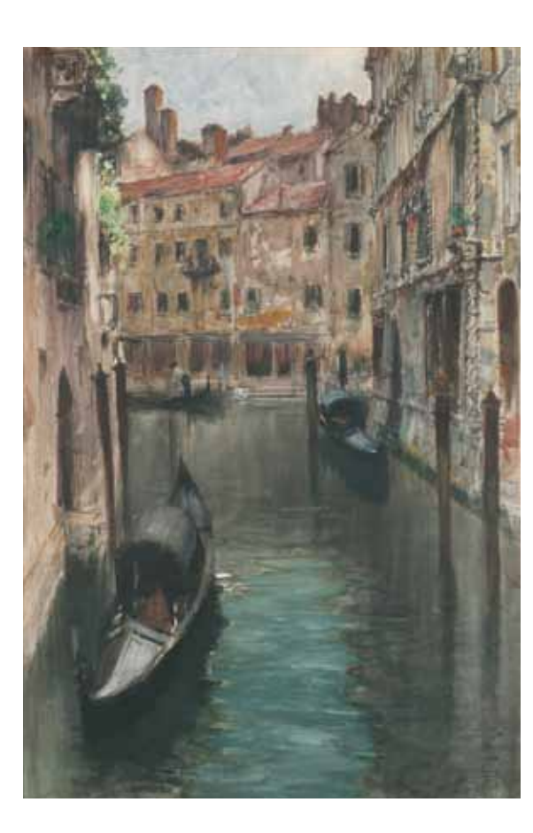
Francis Hopkinson Smith (1838–1915) Venice Mixed media on paper laid down on board 29 x 19 <sup>15</sup>/<sub>16</sub> inches Signed lower right: <u>F Hopkinson Smith</u>