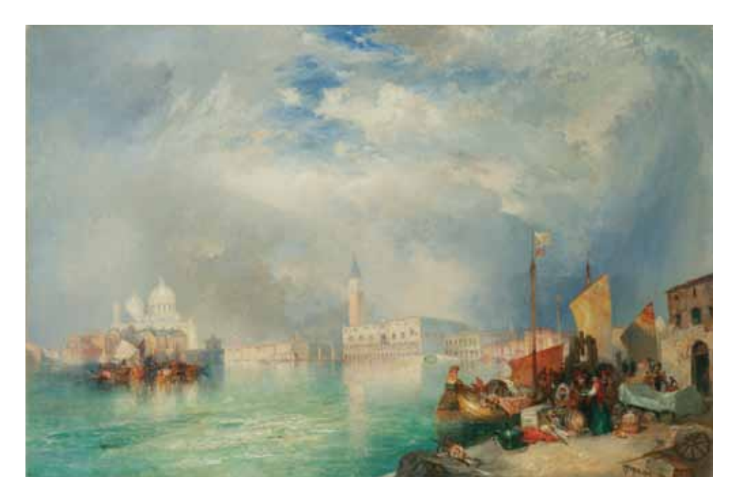
Thomas Moran (1837–1926) Entrance to the Grand Canal, Venice, 1915 Oil on canvas 20^{1/8} \times 30^{1/8} inches Monogrammed and dated lower right: TMoran. 1915.; titled on verso: Entrance to the Grand Canal. | Venice