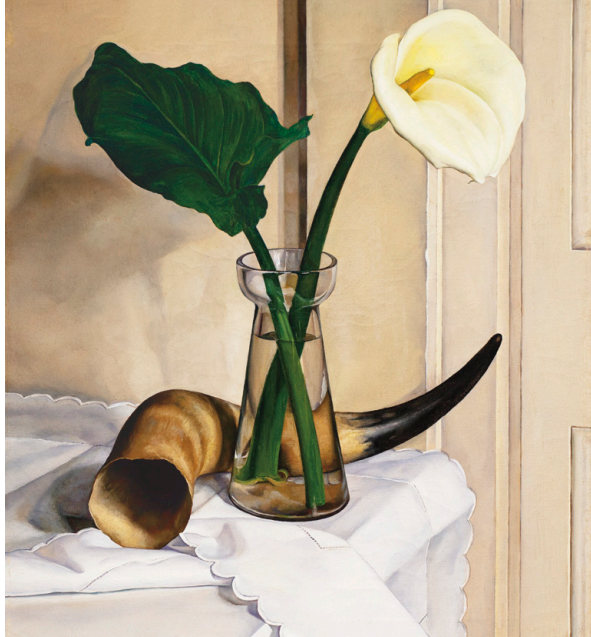
Luigi Lucioni (1900–1988) Still Life by the Windowsill , 1933 Oil on canvas 18 1 / 8 x 16 1 / 16 inches Signed and dated lower left: Luigi Lucioni 1933