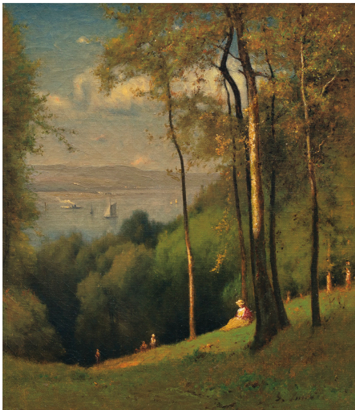
George Inness (1825–1894) On the Hudson (The Distant River) , ca. 1875–78 Oil on canvas 14 1 / 16 x 12 1 / 8 inches Signed lower right: G. Inness $150,000