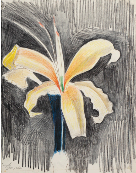
Joseph Stella (1877–1946) Yellow Lily , 1944 Silverpoint and crayon on paper 13 3 / 4 x 10 5 / 8 inches (sight size) Signed and dated lower left: Joseph / Stella 1944 ; estate stamp upper left $12,500