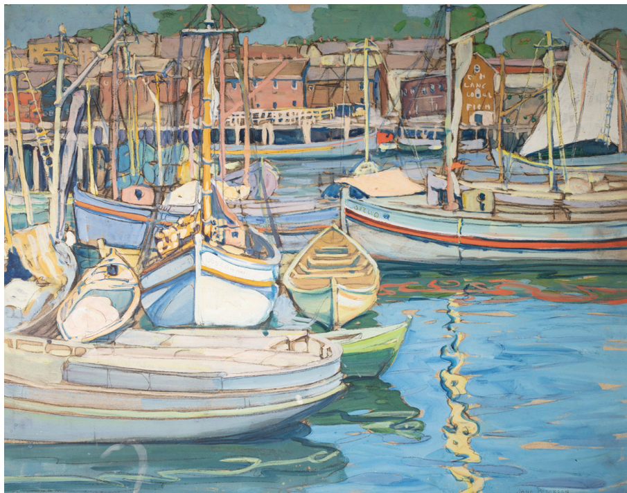
Jane Peterson (1876–1965) Gloucester Harbor Gouache and charcoal on paper 24 1 / 16 x 30 1 / 16 inches Signed lower right: JANE PETERSON